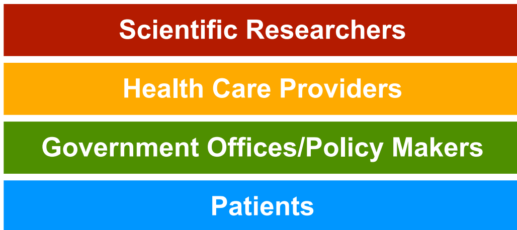
FIGURE 2: THE GLOBAL “SILO”

The Global “Silo” also contributes to failure of undertaking a broad-based inclusive approach.